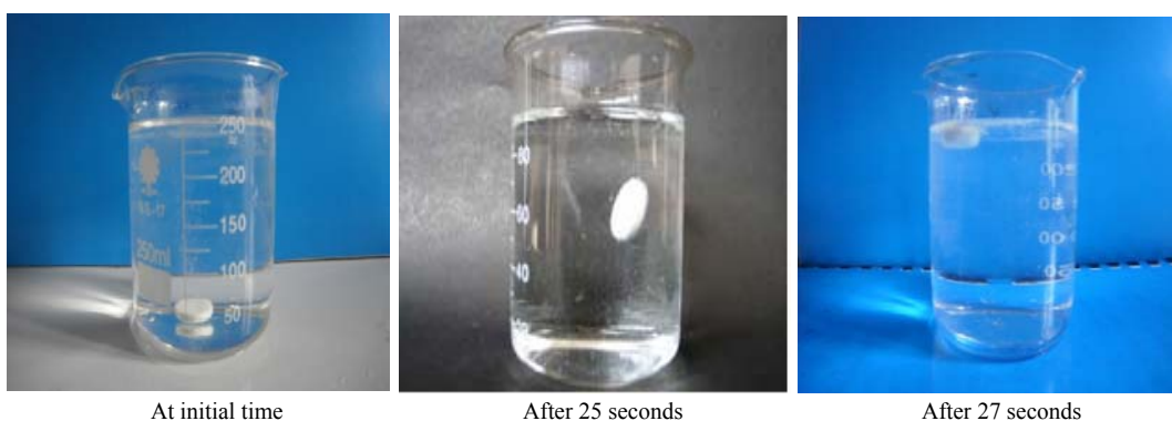
Figure 1. In vitro floating behavior of atorvastatin floating tablet.