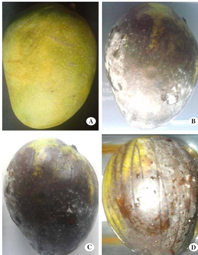
Fig. 2. A-D. Photographs of pathogenicity test in different varieties of mango. A: Control, B: Inoculated fruits with Colletotrichum gloeosporioides , C: Fusarium semitectum and D: Pestalotiopsis guepinii .

Among the isolated fungi C. gloeosporioides , F. semitectum and P. guepinii were found to be pathogenic to all the tested mango varieties. Control set remains fresh without showing any fungal growth (Fig. 2).