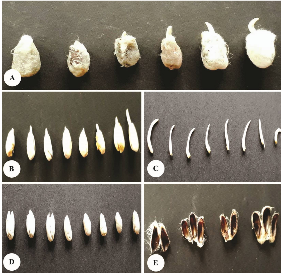
Fig. 1. Different parts of cotton seeds: A. Germinating seeds, B. Embryo with endosperm C. Embryo, D. Endosperm and E. Seed coat.

sterilized potato dextrose agar (PDA) medium. Each Petri plate contained 15 ml of PDA medium with an addition of one drop (ca. 0.03 ml) of lactic acid which was used for checking the bacterial growth. Then the inoculated plates were incubated at room temperature ( 25 \pm 2 °C) for 5 -7 days. The fungi isolated from different seed parts were examined under electron microscope.