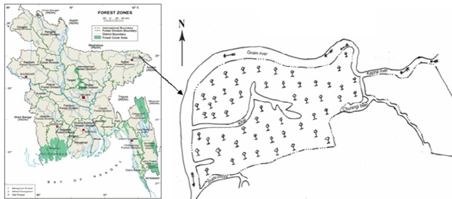
Fig. 1. Map of Ratargul Swamp Forest under the Sylhet Forest Division.

As shown in Fig. 1, Ratargul Swamp Forest is situated in the broad zone of Surma-Kushiyara flood plain in the southern side of the river Goyain under the district of Sylhet (6) . With an area of about 204.569 ha, it is the only swamp forest located in Bangladesh and one of the few freshwater swamp forests in the world. The forest is flooded with water coming from upper stream of the river Goyain during May to