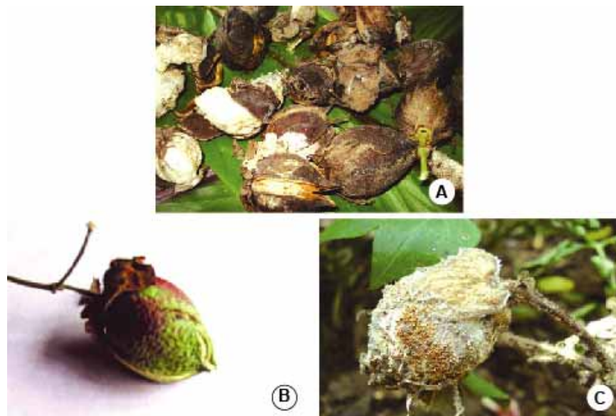
Fig. 1A. Boll rot infected cotton boll, B. Wilt infected cotton boll and C. Infected cotton boll with Sclerotia .

3. Anthraxnose : Infected leaves show pinkish-brown spots that appear specially on lower surfaces. Large areas of the tissues around the veins become yellowish to brownish and eventually dry out. The fungus causes pink boll rot (Fig. 2B). Causal organism: Colletotrichum spp.