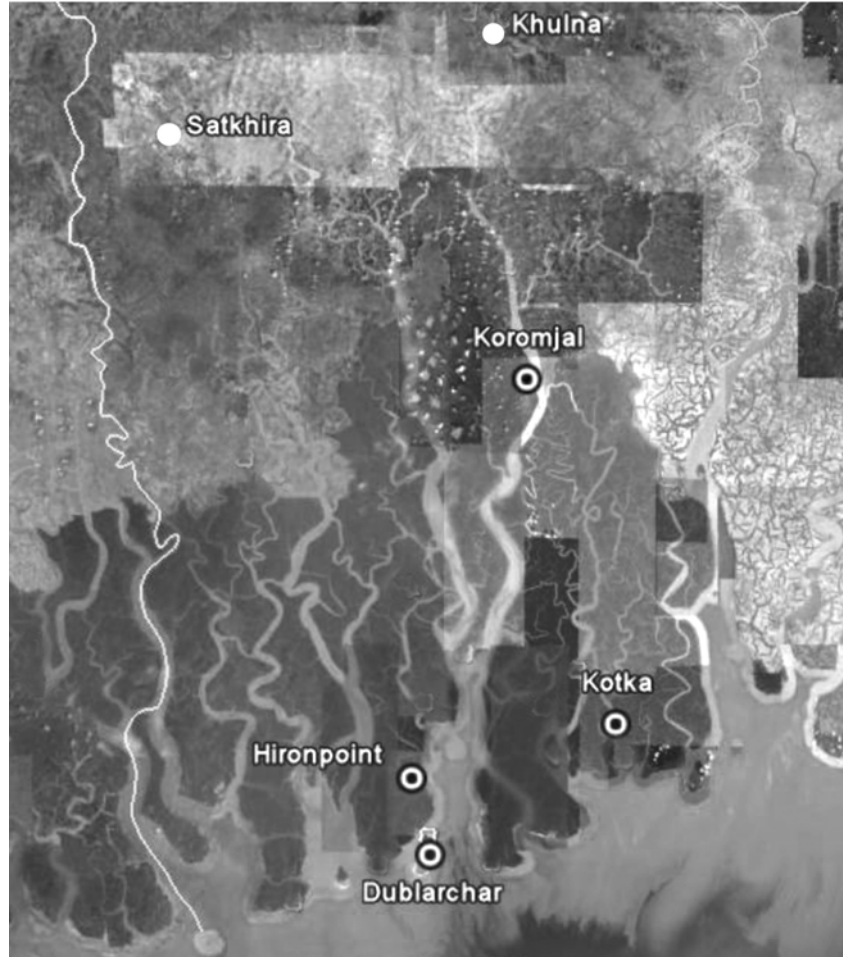
Fig. 1. Map showing the four sites, namely Koromjal, Kotka, Hironpoint and Dublarchar (as indicated by round symbols) in the Sunderban mangrove forests selected for collection of soils in the present study.

also determined by Kjeldahl method following extraction from 10 g dry soil using 1N KCl solution. Organic carbon content (%) of the soil was determined by Wakley and Black method using 1 g soil (10) . Organic matter (%) was determined by multiplying the value of organic carbon by 1.724 (Van Bemmelen factor). Soil salinity was determined as chloride content by following methods described elsewhere (11) .