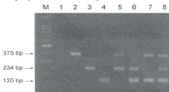
Figure 1. Multiplex PCR detection of Escherichia coli O157:H7, Listeria monocytogenes , and Salmonella enteritidis . Lane 1: negative control; lane 2: 200 fg of S. enteritidis ; lane 3, 200 fg of L. monocytogenes ; lane 4: 200 fg of E. coli O157:H7 DNA per reaction tube; lane 5: 200 fg each of L. monocytogenes and S. enteritidis ; lane 6: 200 fg each of E. coli O157:H7 and L. monocytogenes ; lane 7: 200 fg each of E. coli O157:H7 and S. enteritidis ; lane 8: 200 fg each of E. coli O157:H7, L. monocytogenes and S. enteritidis DNA per reaction tube.

According to the established multiplex PCR system, the detection limit of individual target pathogen was estimated to be 10 cells per reaction tube; which represented 10^3 cfu/ml of culture. When the same protocol was tested with the pure cultures of E. coli O157:H7, L. monocytogenes and S. enteritidis , we achieved the same level of sensitivity for the detection of each pathogen as previously reported. The sensitivity was also determined with